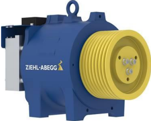
ZAtop – SM200.15D